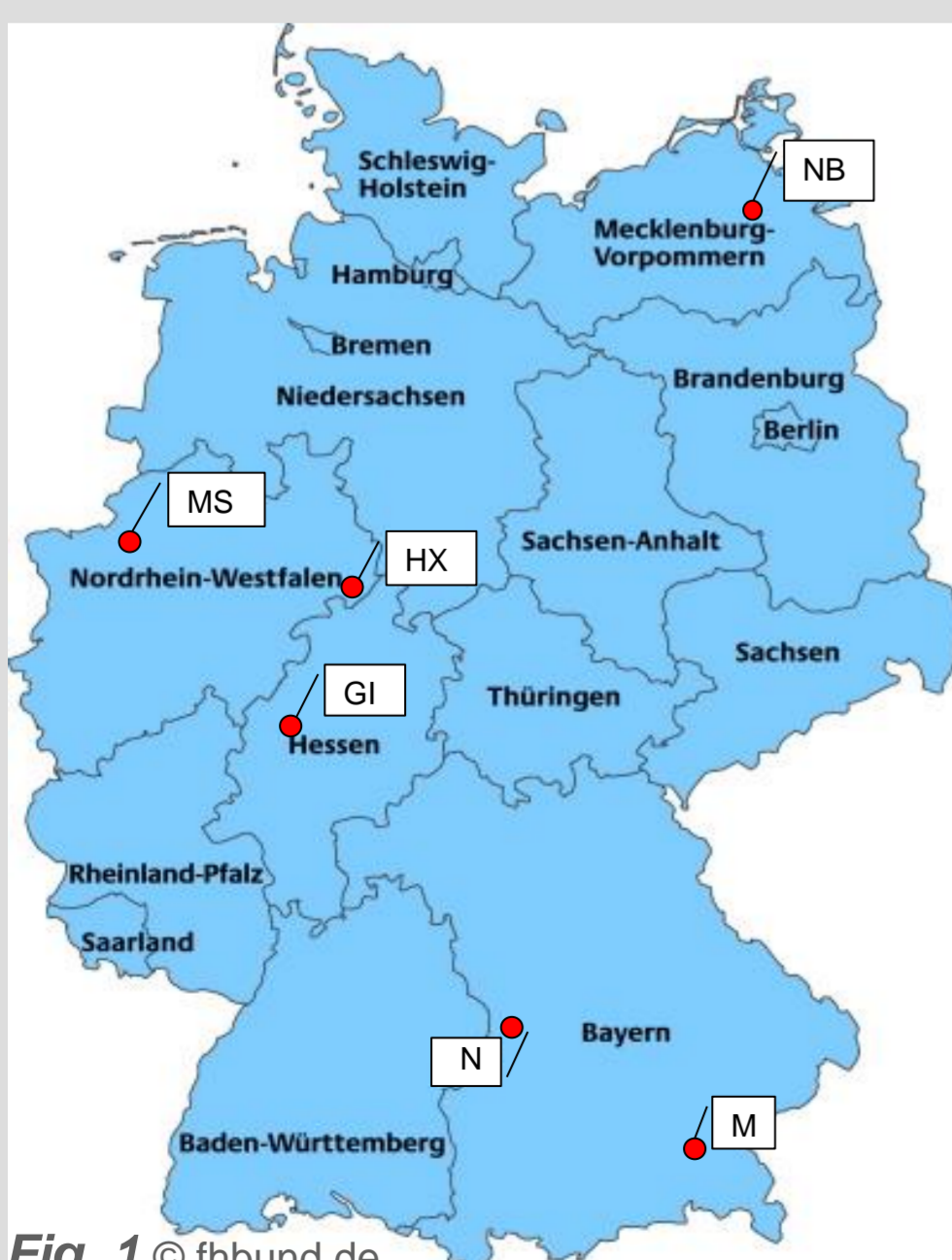
Fig. 1