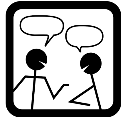
discussion / communication skills