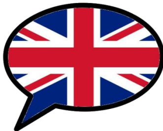
english language skills